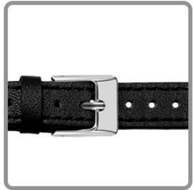
Genuine leather strap