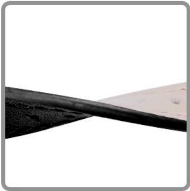
Strap is soft