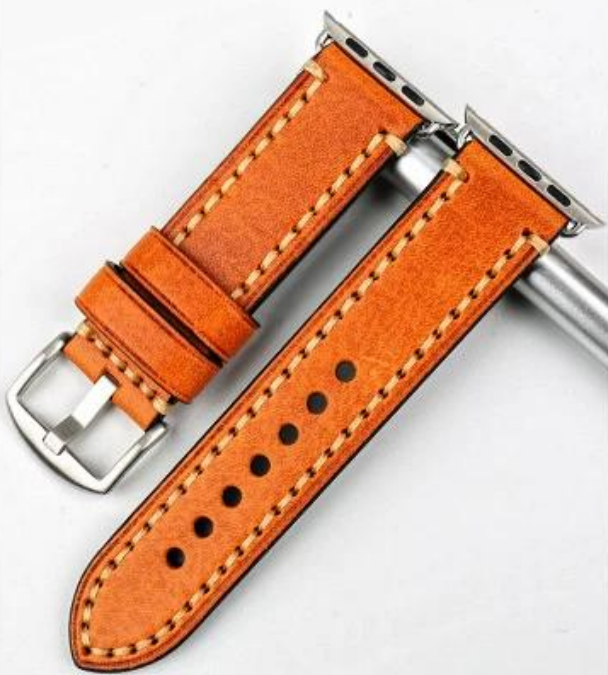
Light Brown S