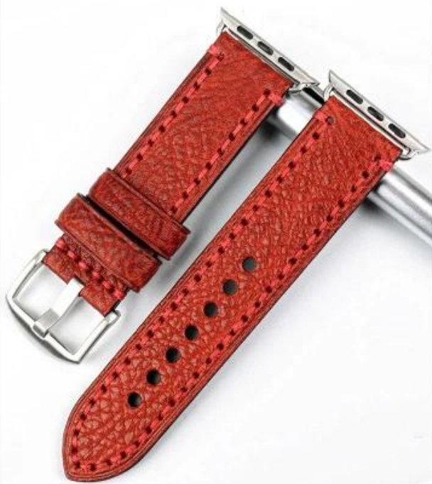
Dark Red S