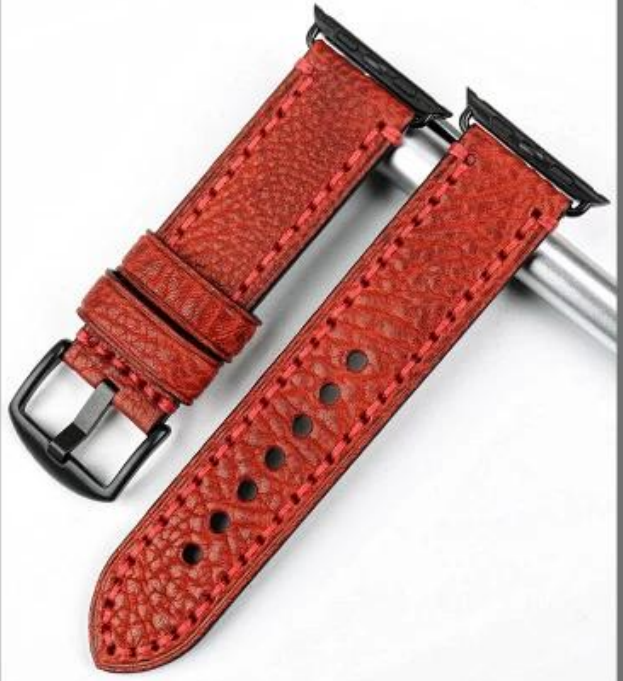
Dark Red B