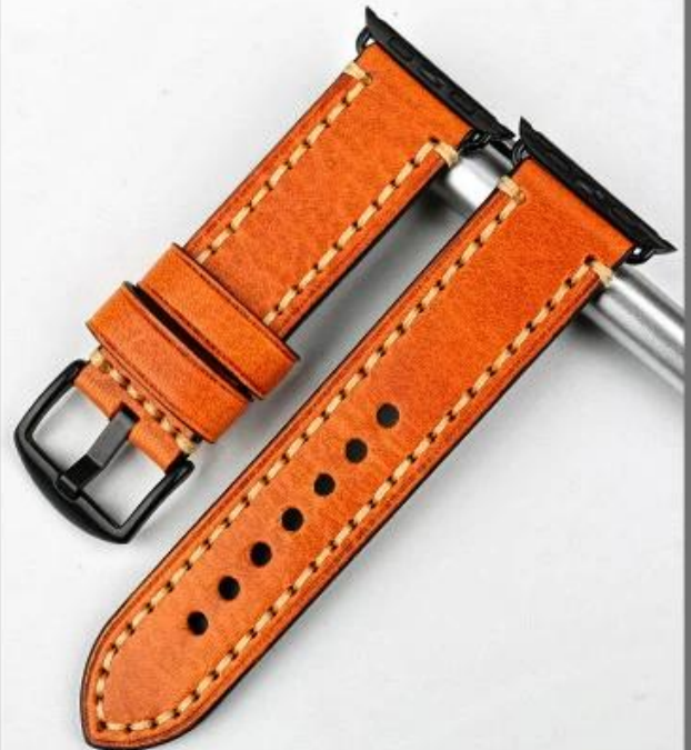
Light Brown B