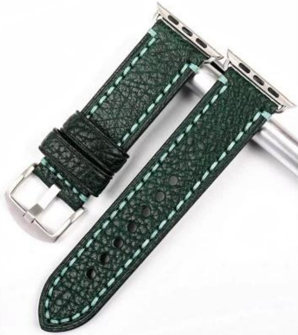
Dark Green S