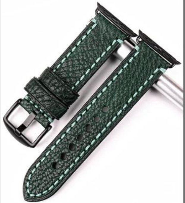
Dark Green B