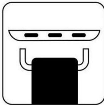
2. Align sheet-metal and metal axle