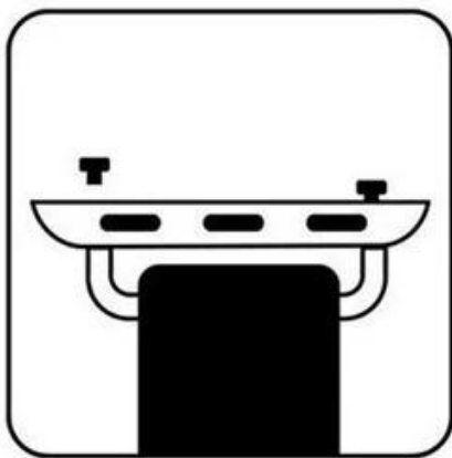
3. Locate screw into metal axle hole, tighten it