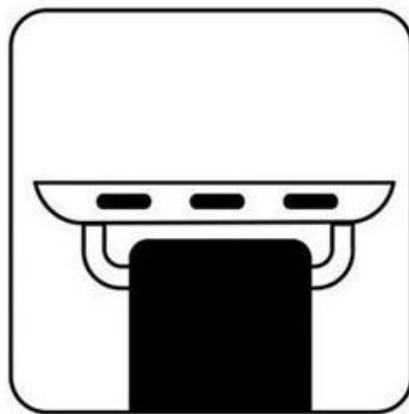
4. The installation is done