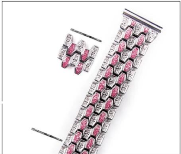
04: Add links on- Align the needle end of the pin to small hole in the band according the arrow direction showing in picture, rotating the wheel to push the pinhead in completely.