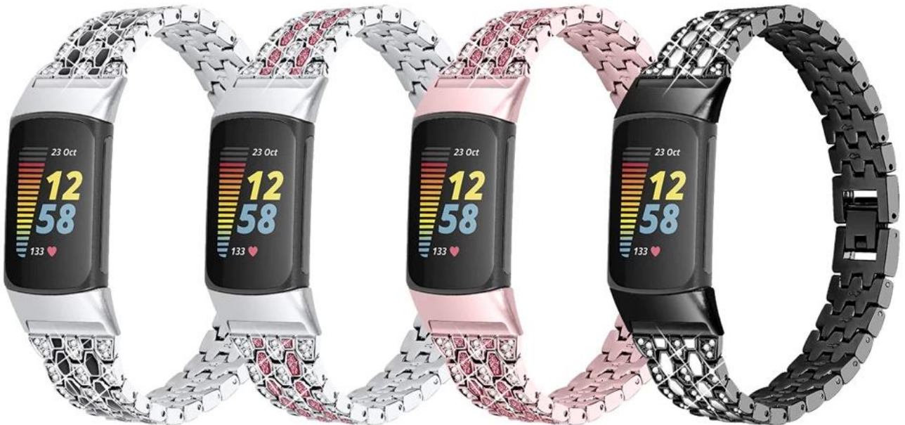
4# 黑间白 Black/White