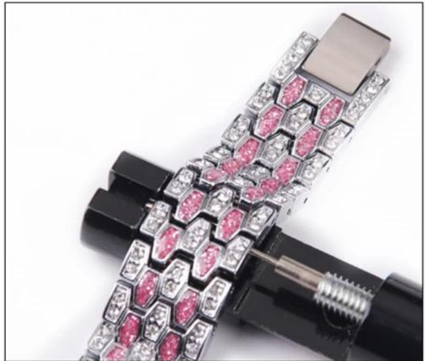
02: Remove extra links- Align the pin inside the band to tool needle according the arrow direction showing in picture, rotate the tool wheel to push the pin out.