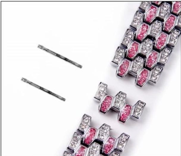
03: Pull the pin out with your hand when the needle head comes out.