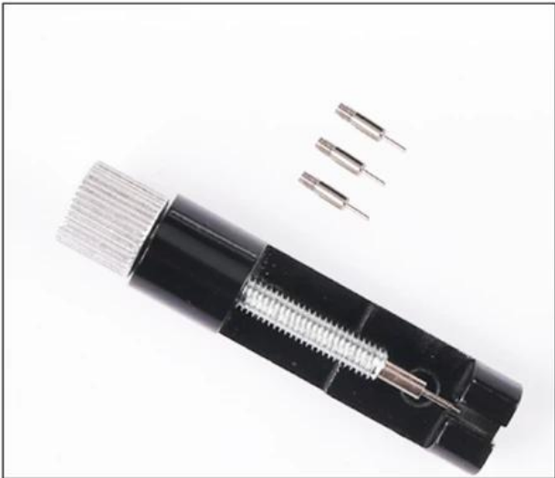
01: Comes with a tool kit to adjust the band easily.