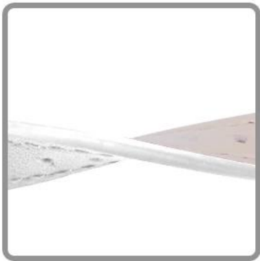
Strap is soft