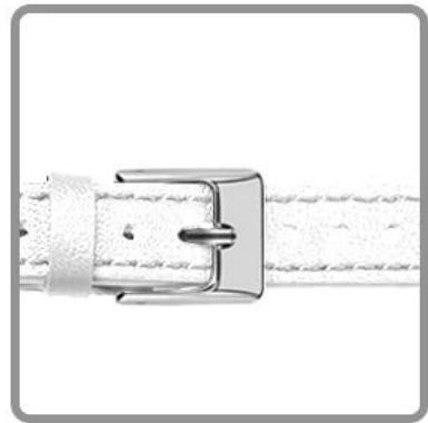
Genuine leather strap