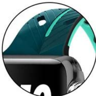
Card-bit precision seamless fit