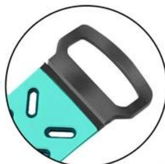
Stainless steel pin