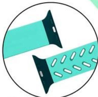
One-piece molding process