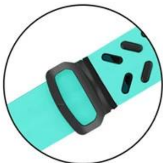
Easy to clasp the pin-tuck lock