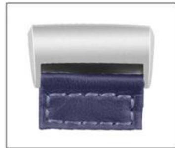
Metal head grain