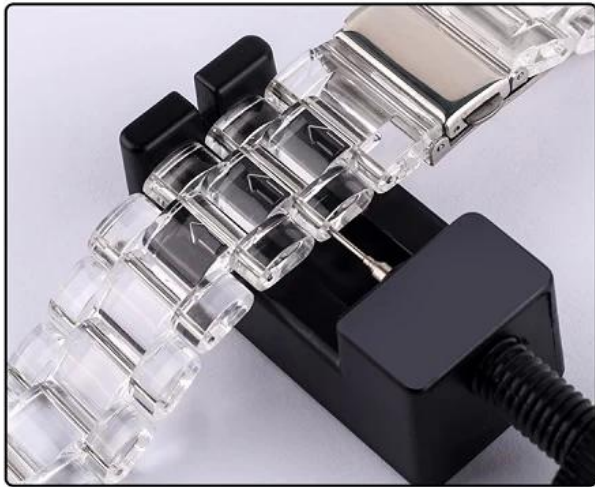
Remove bracelet links as the arrow indicate