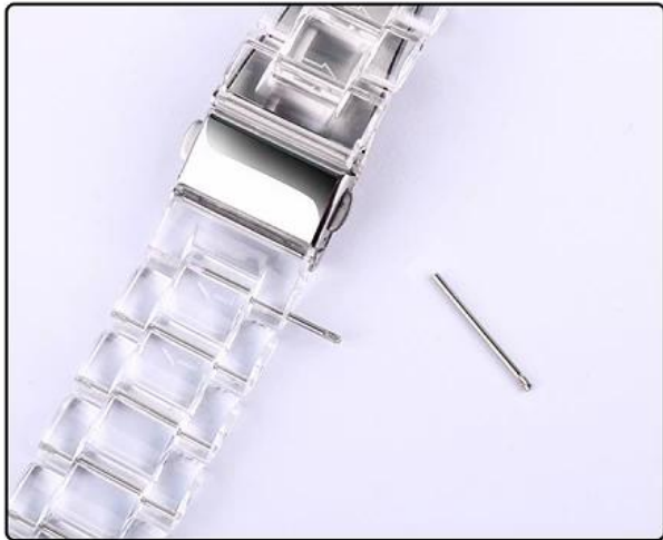
Assemble the links and pinks in the opposite arrow direction