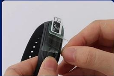
4. Tear off the other side of the film and press it