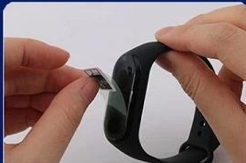
5. Then remove the No. 2 label film