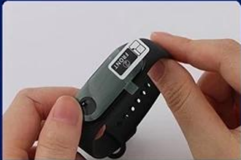
3. Align the position