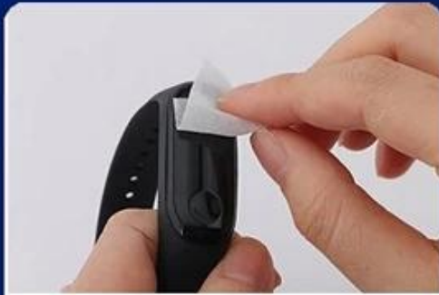
1. Clean the handle ring