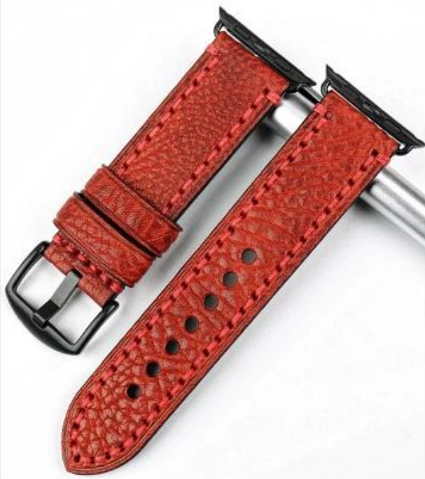
Dark Red B