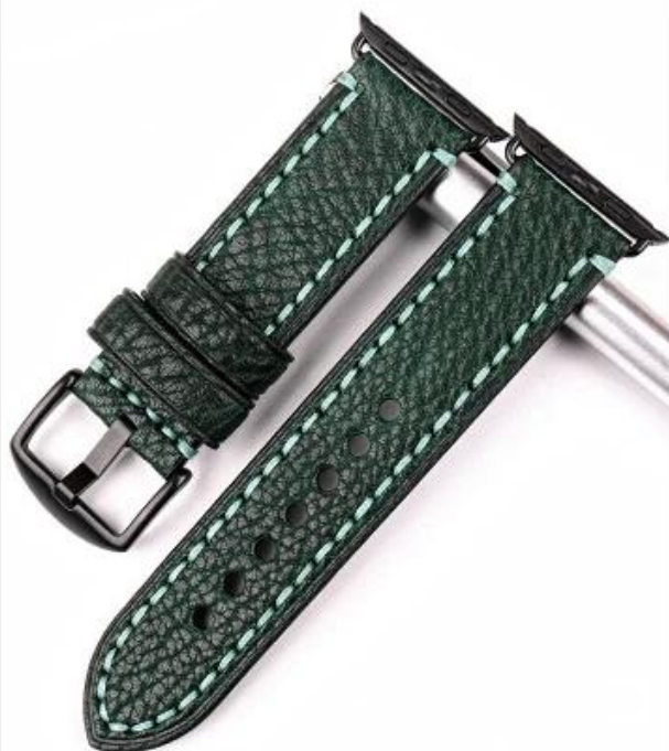
Dark Green B