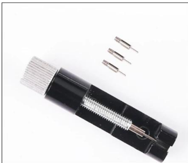
01: Comes with a tool kit to adjust the band easily.