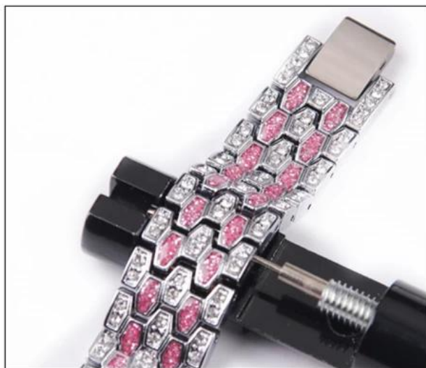
02: Remove extra links- Align the pin inside the band to tool needle according the arrow direction showing in picture, rotate the tool wheel to push the pin out.