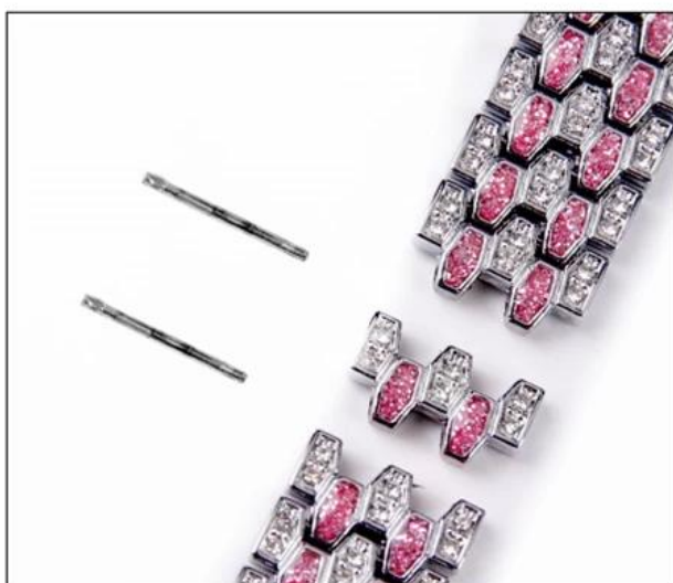
03: Pull the pin out with your hand when the needle head comes out.