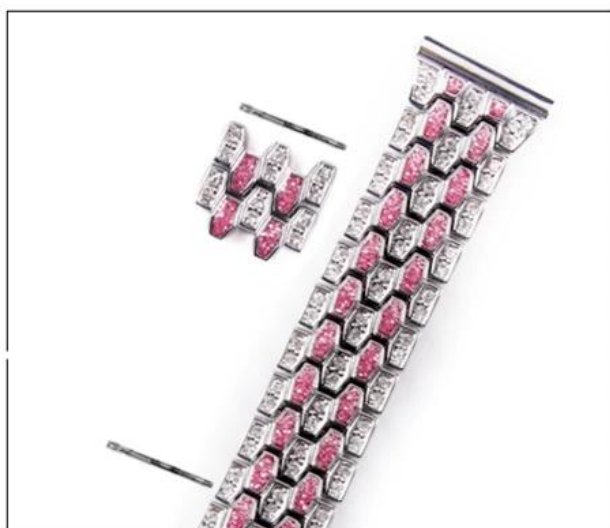
04: Add links on- Align the needle end of the pin to small hole in the band according the arrow direction showing in picture, rotating the wheel to push the pinhead in completely.