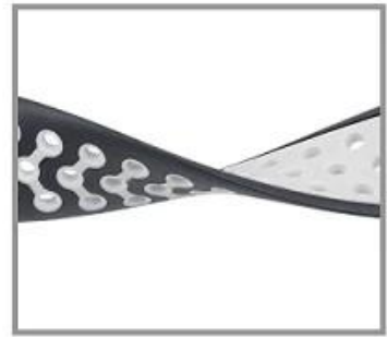
Premium Silicone Material