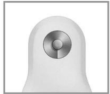
Stainless Steel Pin-and tuck Clasp