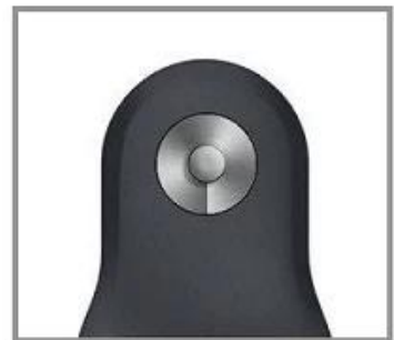
Stainless Steel Pin-and tuck Clasp