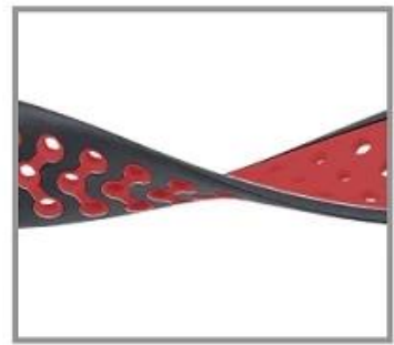
Premium Silicone Material