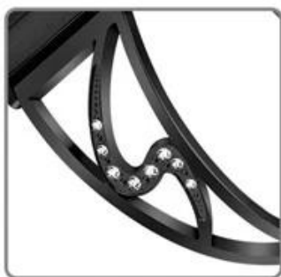
Beautifully inlaid brick, attract attention