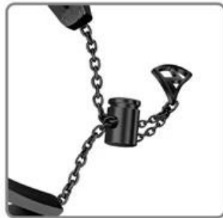
Premium material, smart design