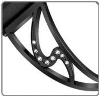
Beautifully inlaid brick, attract attention