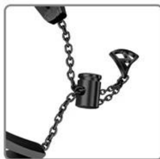
Premium material, smart design