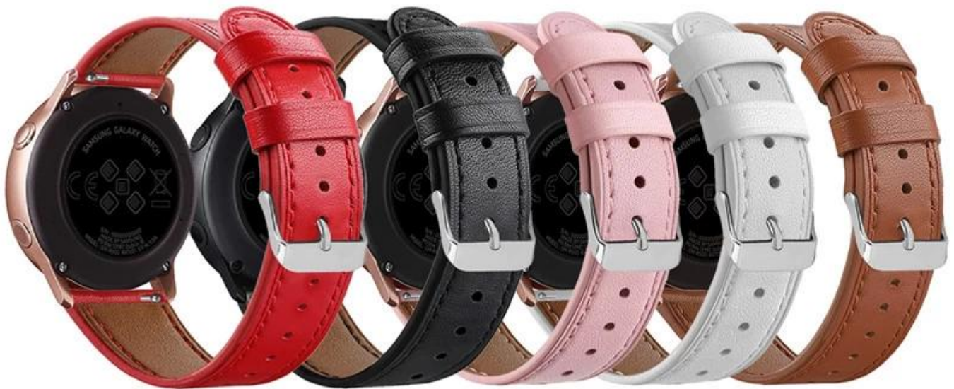
红色 黑色 粉色 白色 棕色