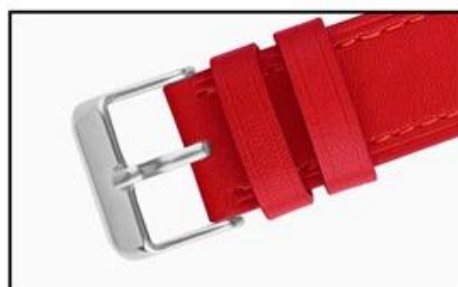
Stainless steel buckle