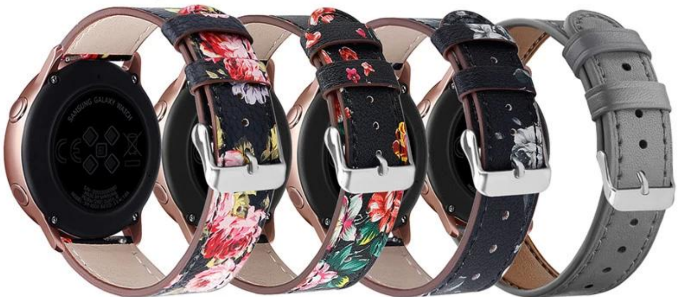
粉花 红花 灰花 灰色