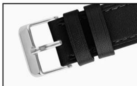
Stainless steel buckle