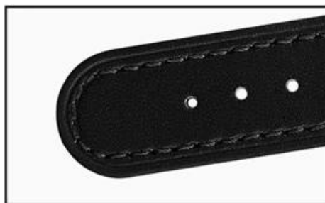
Round leather tail