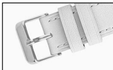
Stainless steel buckle