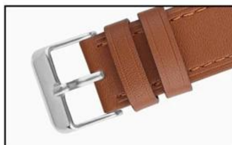
Stainless steel buckle