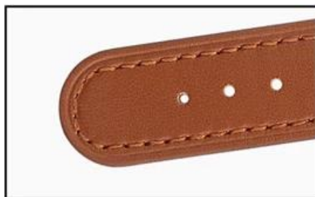
Round leather tail