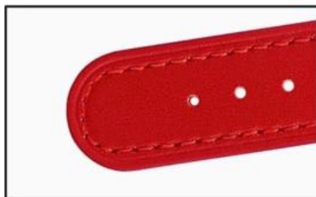
Round leather tail