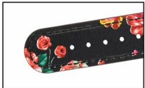
Round leather tail