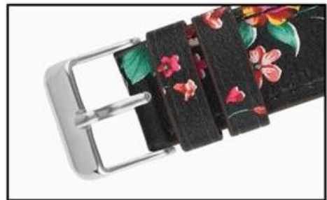
Stainless steel buckle