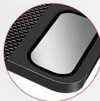
Strong Magnetic Clasp