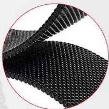
Breathable to Wear

compatible with any watches ( including traditional and smart watch) which use the standard spring bars with the width of 22mm.