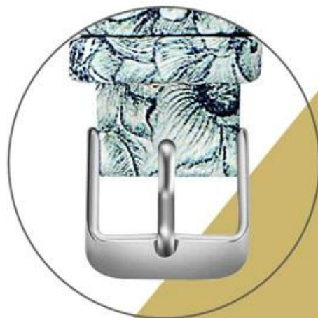
Stainless steel buckle