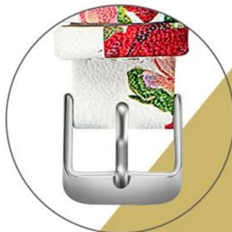
Stainless steel buckle