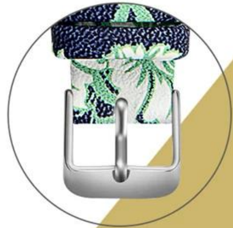
Stainless steel buckle