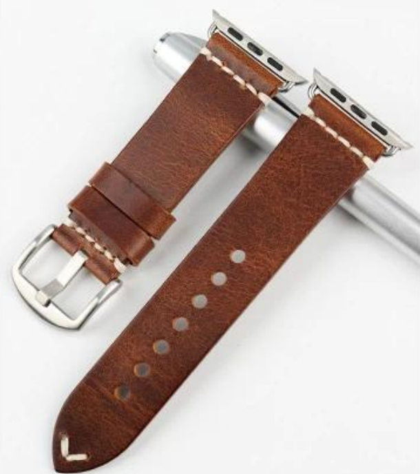
Light Brown S