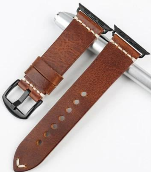
Light Brown B