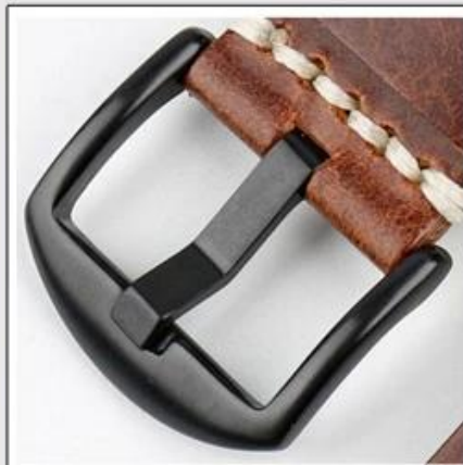
stainless steel buckle