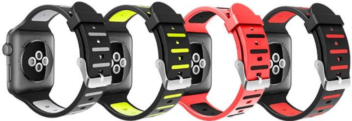
1. 黑灰 Black+Grey