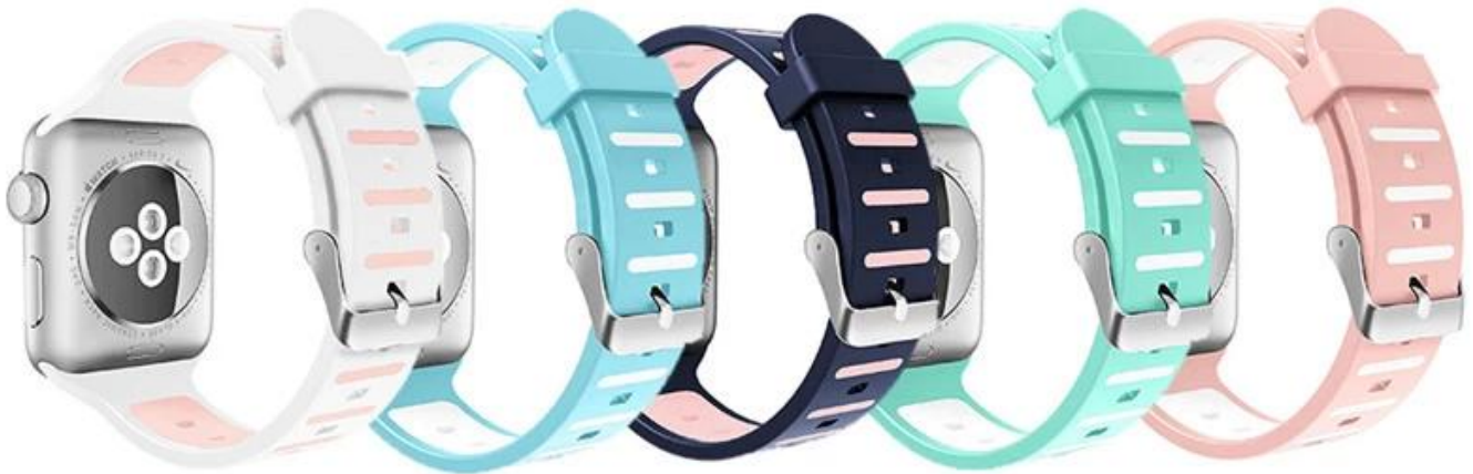
5. 白粉 White+Pink