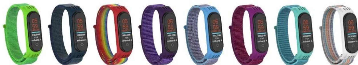
① 薄荷绿 ② 深雾灰 ③ 渐变彩虹 ④ 薰衣草 ⑤ 蔚蓝 ⑥ 火龙果 ⑦ 菊蓝 ⑧ 彩虹条