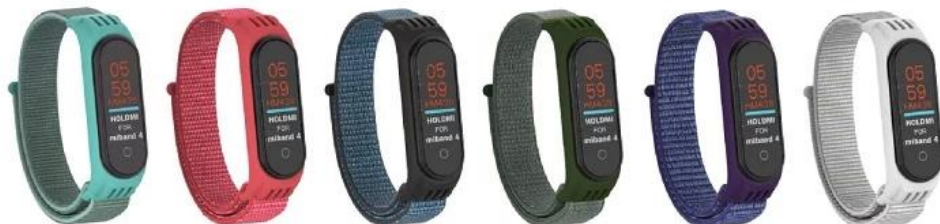
㉕ 碧海 ㉖ 木槿粉 ㉗ 葡萄紫 ㉘ 深橄榄 ㉙ 午夜蓝 ㉚ 海贝