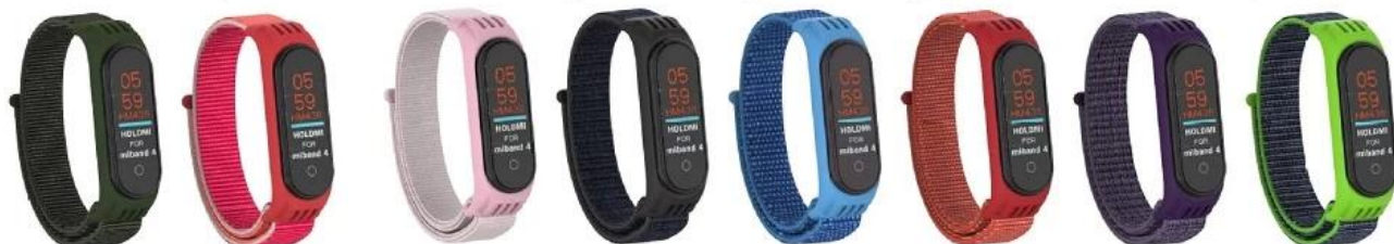
⑨ 军绿 ⑩ 石榴 ⑪ 珍珠粉 ⑫ 黑砂 ⑬ 海角蓝 ⑭ 玫瑰红 ⑮ 烟紫 ⑯ 亮黄