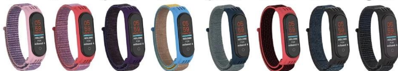
⑰ 粉砂 ⑱ 杏桃 ⑲ 靛蓝 ⑳ 驼色 ㉑ 风云灰 ㉒ 红黑条 ㉓ 灰黑 ㉔ 黑白条