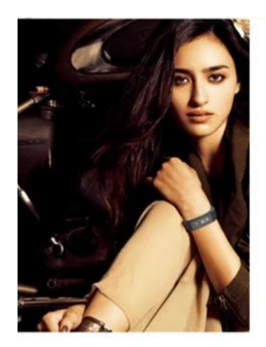
Beauty show This is your i5 Plus!