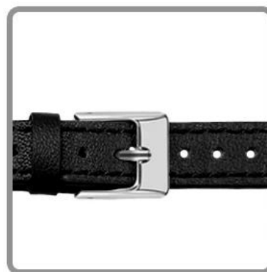
Genuine leather strap