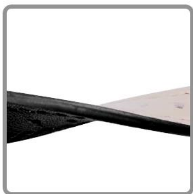
Strap is soft